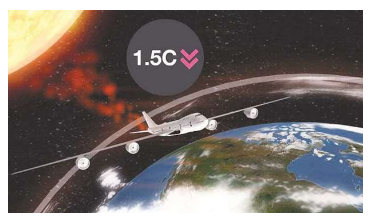
By David Keith/ Cambridge

Negotiations on geoengineering technologies ended in deadlock at the United Nations Environment Assembly in Nairobi, Kenya, last week, when a Swiss-backed proposal to commission an expert UN panel on the subject was withdrawn amid disagreements over language. This is a shame, because the world needs open debate about novel ways to reduce climate risks.