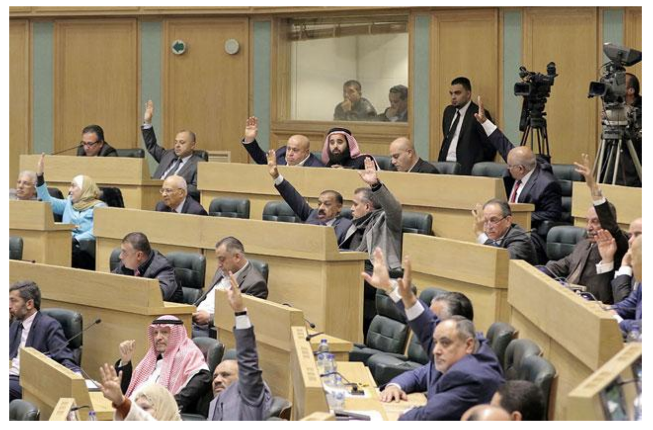
AMMAN — The Lower House on Tuesday declared its "utter rejection" of the gas deal between Jordan's National Electric Power Company (NEPCO) and the Israeli occupation authorities.