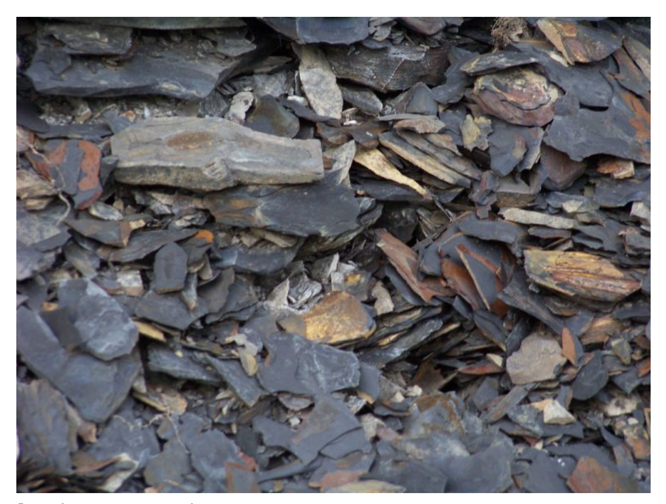
Bloomberg New York