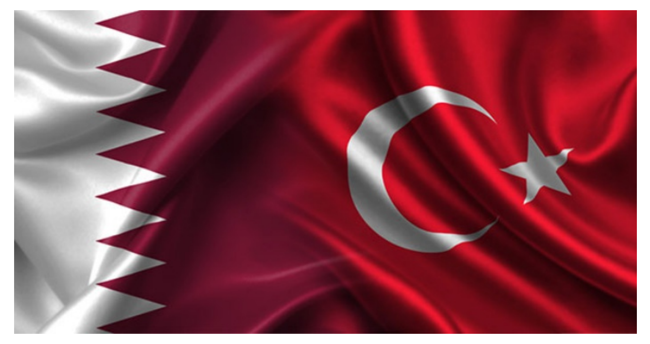
ANKARA (Reuters) — Qatar pledged $15 billion (£11.8 billion) of investment in Turkey on Wednesday

that a government source in Ankara said would be channelled into its banks and financial markets.