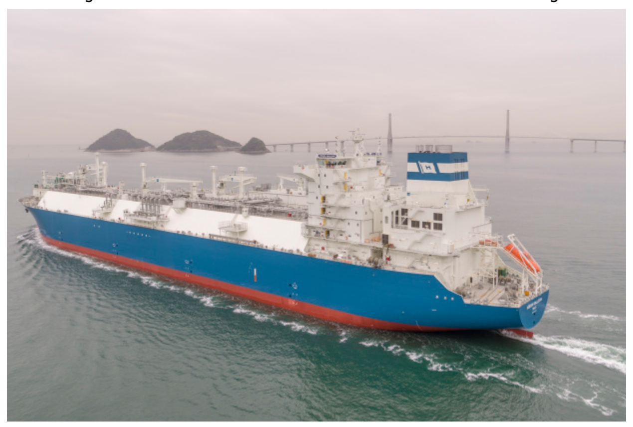
The Australian Industrial Energy consortium plans to lease this floating storage and re-gasification vessel to process natural gas imports.

coast have experienced occasional blackouts, hitting everything from health clinics to schools. Analysts predict a widening shortfall of LNG, raising concern manufacturers won't have enough power to run food-processing factories or chemical plants. While Australia is rich in natural gas, it lacks a nationwide network of pipelines to supply users at affordable rates. The fuel is super-chilled into LNG for shipment around the country and abroad. Australia is projected to export 80.73 million metric tons of LNG this year, compared with 70.23 million metric tons in 2018, according to the research firm Wood Mackenzie. The electricity blackouts occurred as Australians endured a scorching Southern Hemisphere summer, with heat waves across the country that were unprecedented in scale and duration. On a couple of days in January, the temperature in Sydney reached 108 degrees Fahrenheit. This year, the country recorded its warmest January-through-May period ever, according to the Bureau of Meteorology. Electricity use for cooling spikes with such temperatures, but it isn't only in summer that demand for LNG can outpace supply. In the southern city of Melbourne, gas supplies are at their tightest in the winter when demand for heating kicks in.