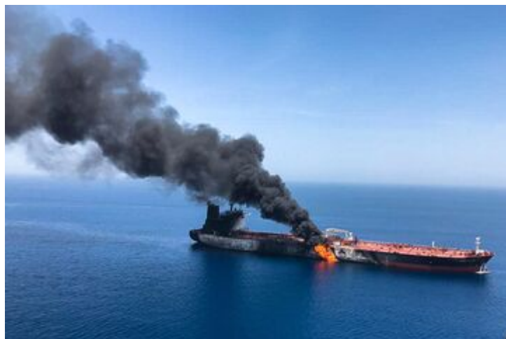
The Front Altair vessel.