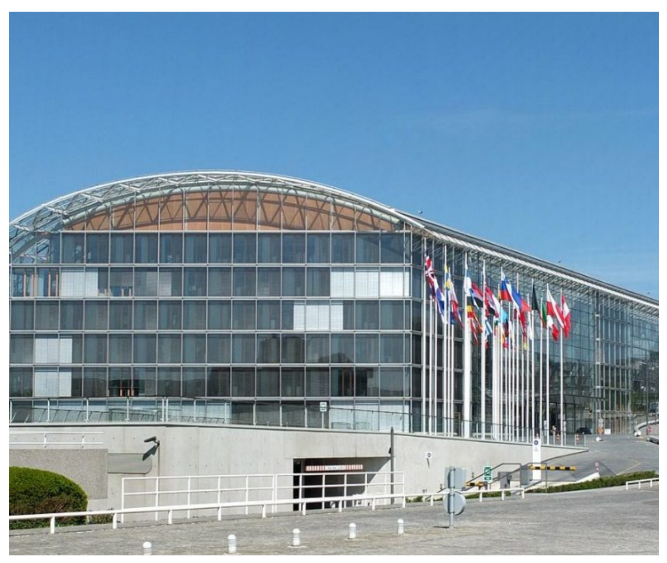
By Ewa Krukowska, Bloomberg

The European Investment Bank adopted an unprecedented strategy to end funding for fossil fuel energy projects, in a move expected to support Europe's plans to become the first climate-neutral continent.