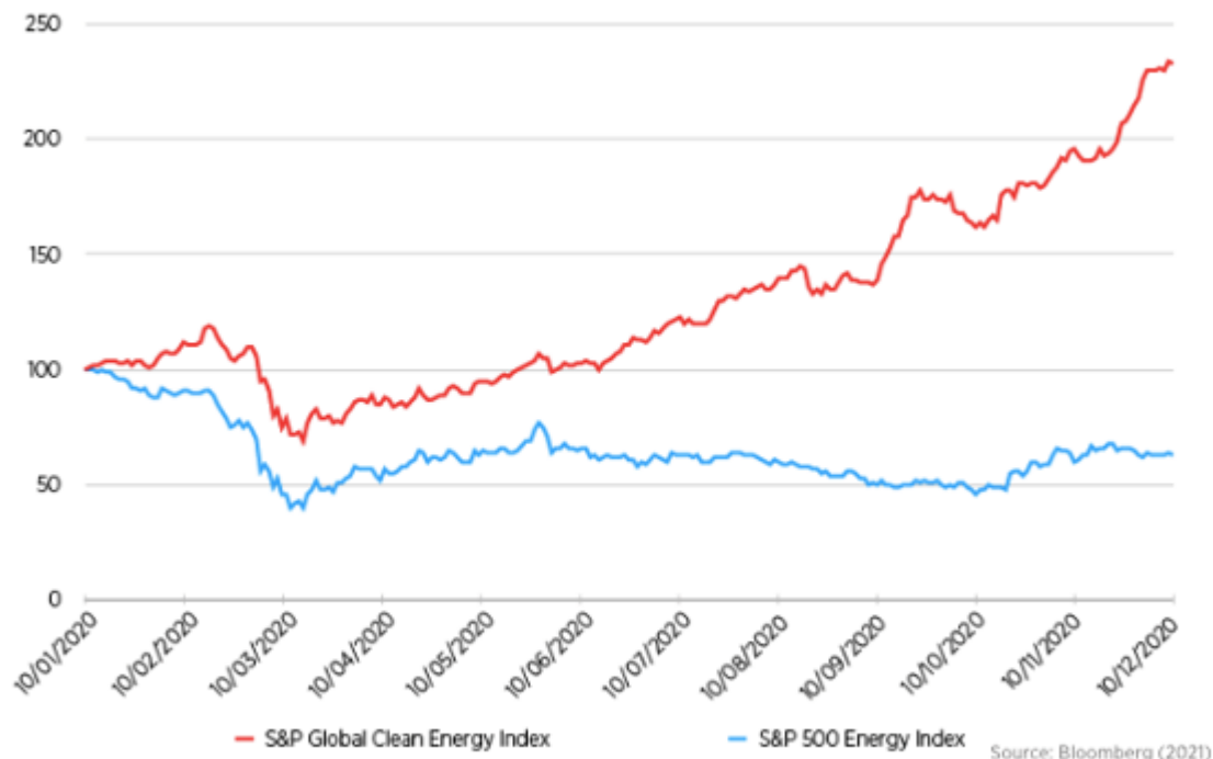
Figure 7: Performance of clean energy and fossil energy stocks in 2020