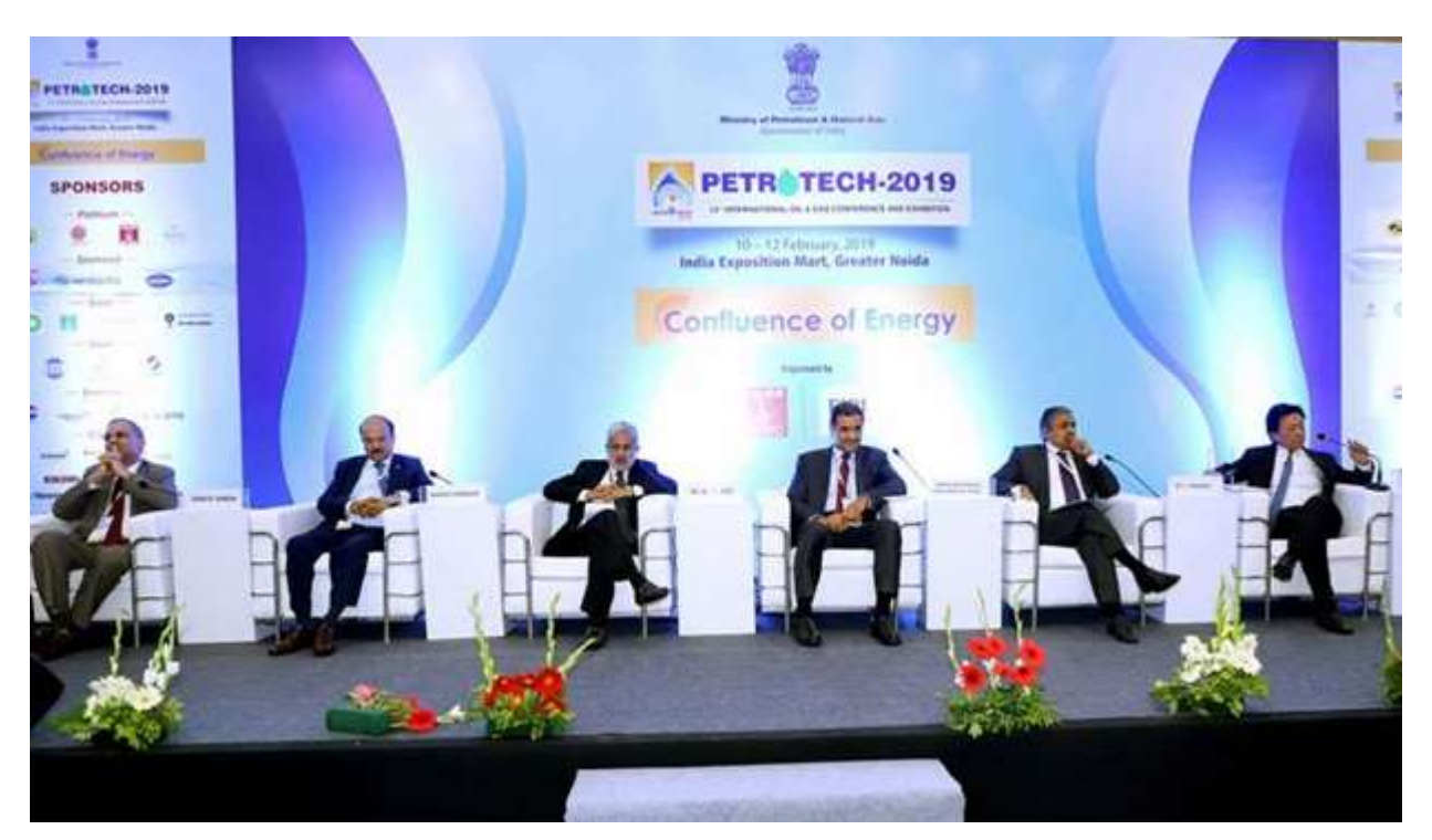
*Sheikh Khalid encouraged Indian government to create conducive environment for increased use of the clean fossil fuel

Qatargas CEO Sheikh Khalid bin Khalifa al-Thani has underscored the significance of liquefied natural gas (LNG) as a "destination fuel" in the future of energy, playing a major role in the 'energy transition' the world is embarking on.