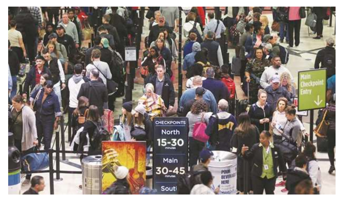
By Nouriel Roubini /New York

After the synchronised global economic expansion of 2017 came the asynchronous growth of 2018, when most countries other than the United States started to experience slowdowns. Worries about US inflation, the US Federal Reserve's policy trajectory, ongoing trade wars, Italian budget and debt woes, China's slowdown, and emerging-market fragilities led to a sharp fall in global equity markets toward the end of the year.