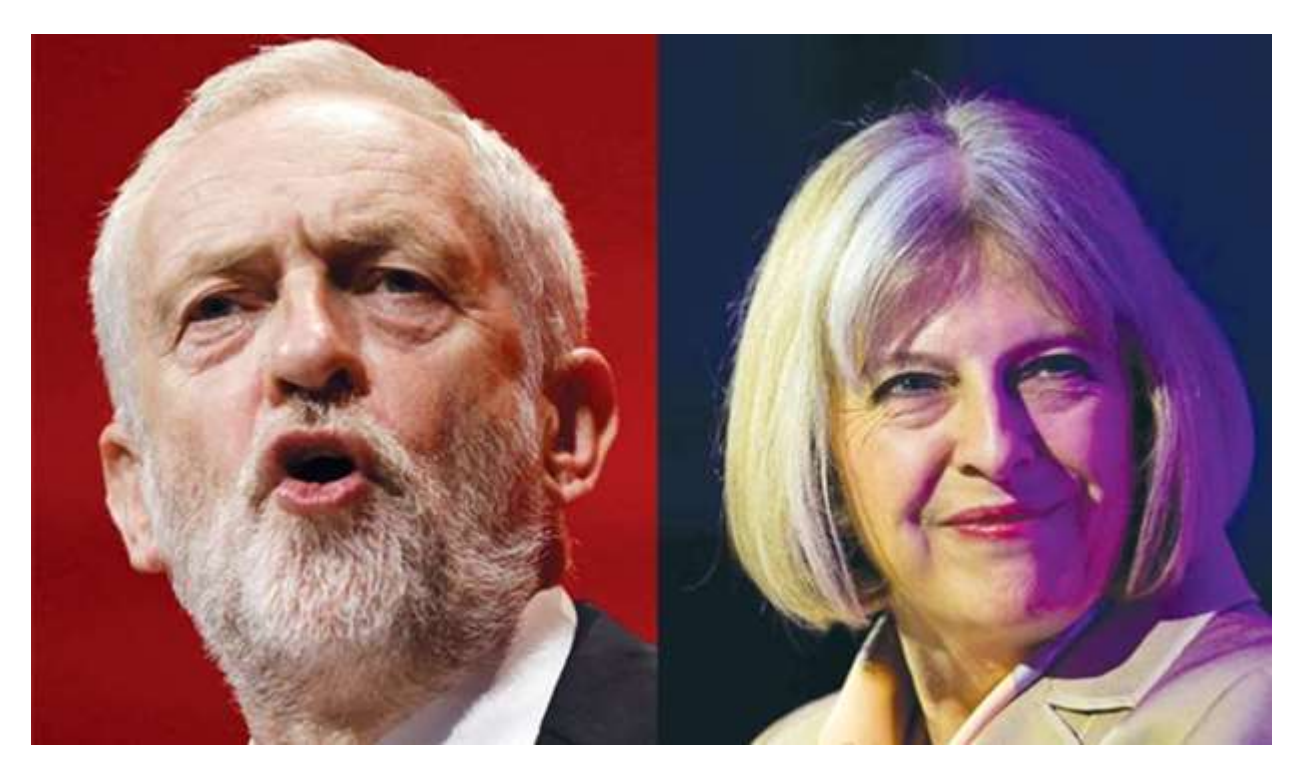
By George Soros /Munich

Europe is sleepwalking into oblivion, and the people of Europe need to wake up before it is too late. If they don't, the European Union will go the way of the Soviet Union in 1991. Neither our leaders nor ordinary citizens seem to understand that we are experiencing a revolutionary moment, that the range of possibilities is very broad, and that the eventual outcome is thus highly uncertain.