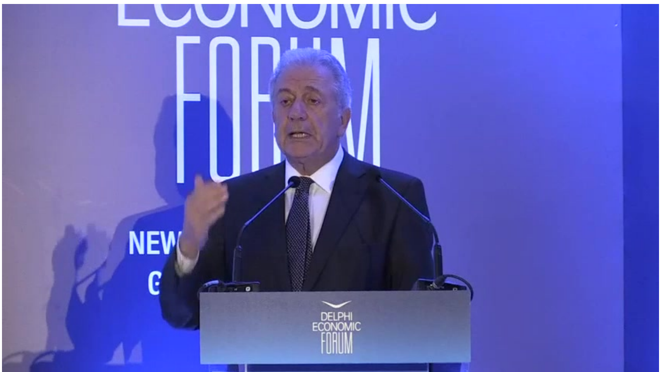
European Commissioner for Migration, Home Affairs, and

When asked whether he believes that Greece can and should reduce its primary surplus and its tax burden, he was diplomatic, noting that this was a very sensitive moment because the country will hold elections this year. “I think the first thing that needs to be done by the government that will arise from the elections is to show its commitment to reforms,” he said.