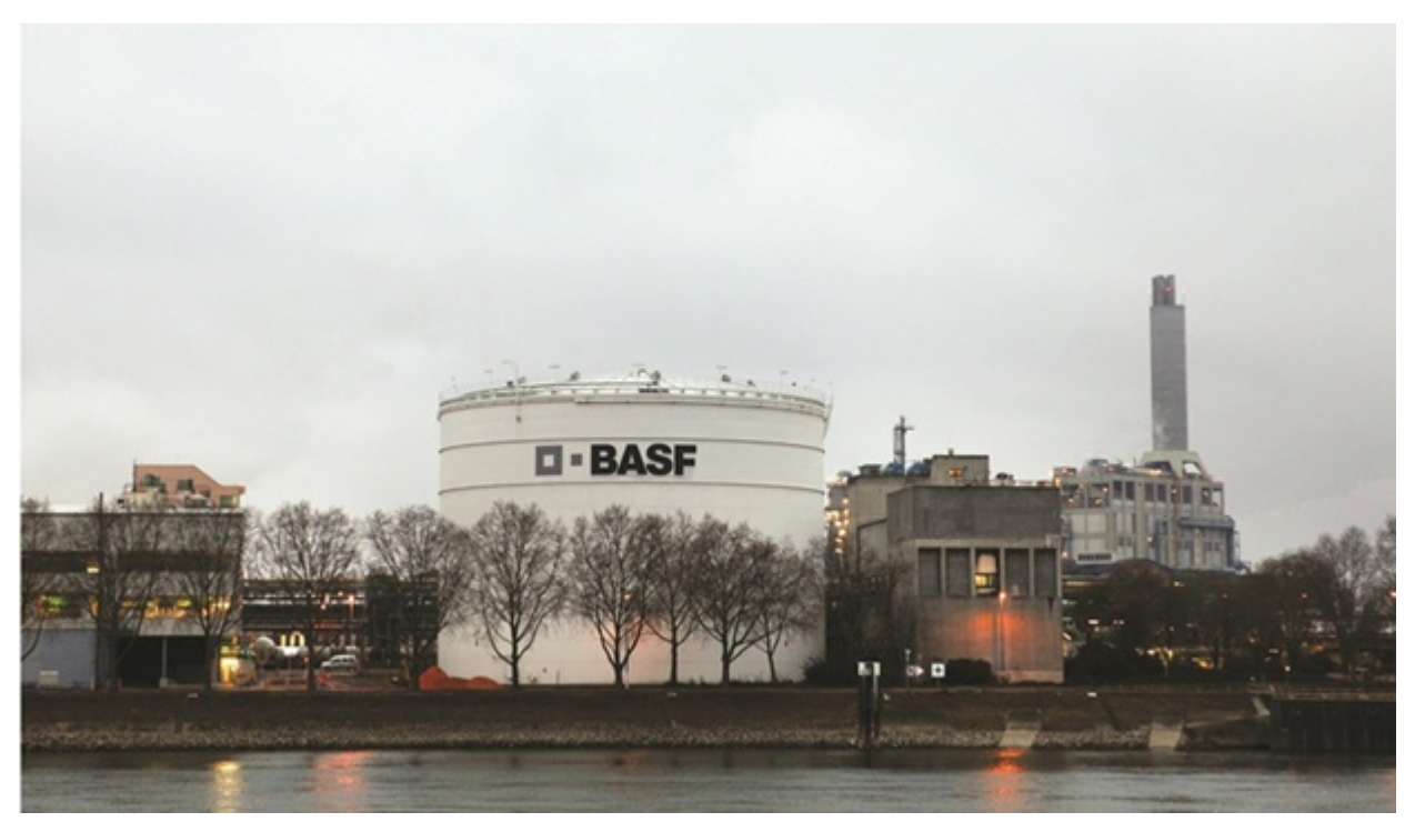
Bloomberg / Brussels

Europe's biggest industrial firms have been banking on spring to bring down soaring energy costs. Those hopes faded this week as Russian tanks rolled into Ukraine.