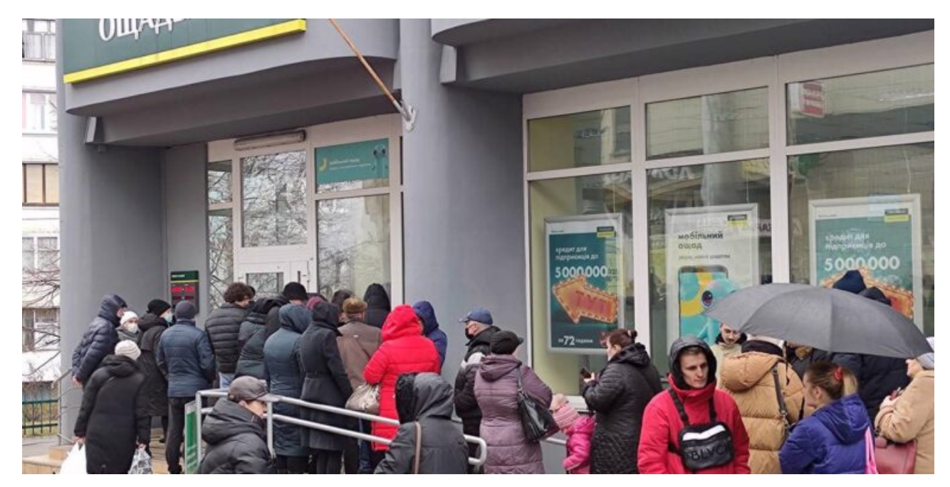
Feb 25, 2022JASON FURMAN

Russia's invasion of Ukraine has been rapid and dramatic, but the global economic consequences will be much slower to materialize and less spectacular. Yet, other than Ukraine, Russia will likely be the biggest long-term economic loser from the conflict.