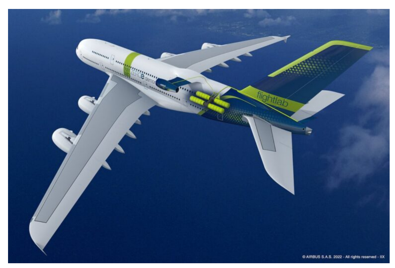
By Alex Macheras

Airbus this week announced it will modify a superjumbo A380 to test a hydrogen-powered jet engine as the European aerospace group prepares to bring a zero emissions aircraft into service by 2035.