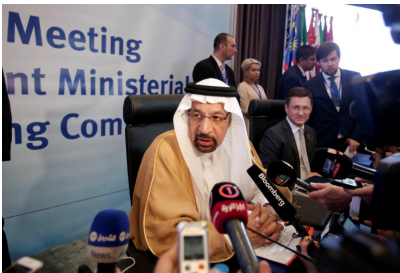
ALGIERS (Reuters) – OPEC's leader Saudi Arabia and its biggest