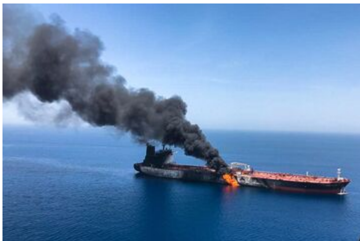
The Front Altair vessel.