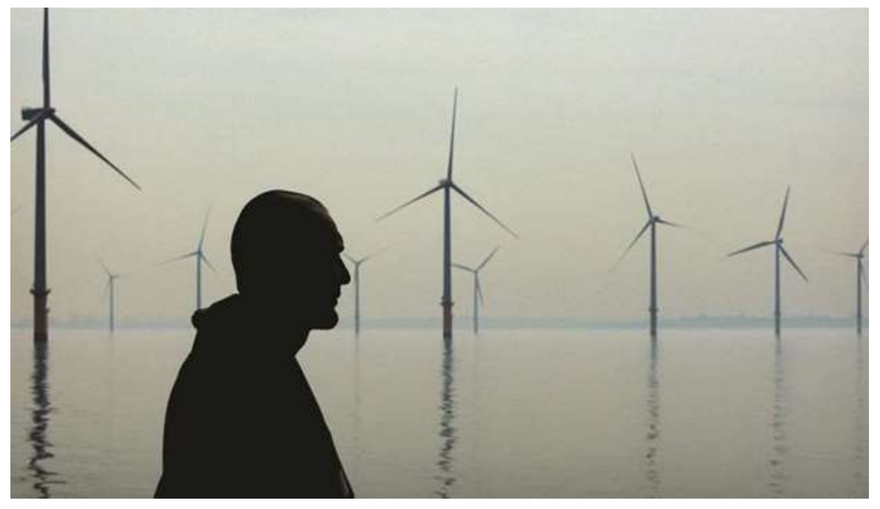
By Carl Bildt /Stockholm

Heat waves and extreme-weather events across the Northern Hemisphere this summer have brought climate change back to the forefront of public debate.