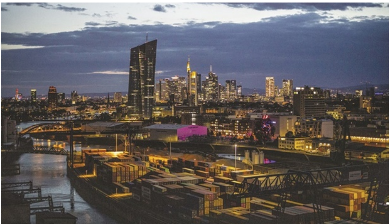
AFP / Berlin