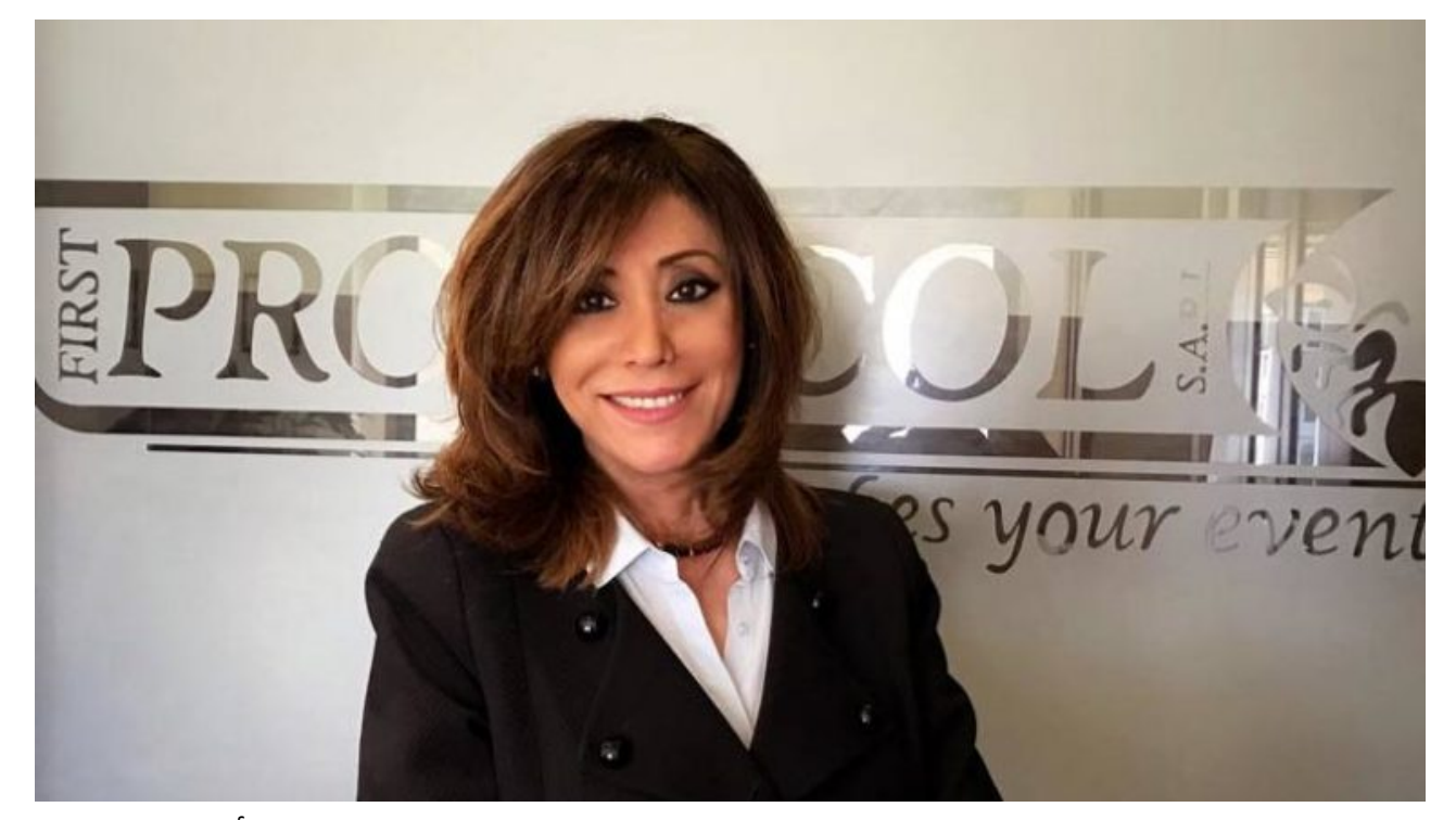
بدا كلام رئيس الحكومة اللبناني سعد الحريري عن تشبيه أزمة لبنان باليونان، وكأنه بمثابة الإنذار الأخير قبل السقوط. كثر تلقفوا