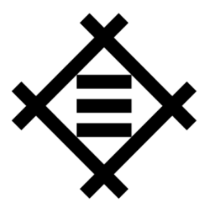
MITSUI & CO.

MOSCOW/DUBAI (Reuters) — Japan's Mitsui & Co Ltd (8031.T), Russian sovereign wealth fund RDIF and Saudi Aramco are in talks to buy stakes in Novatek's (NVTK.MM) Arctic LNG 2 project, with the size of the investments still to be decided, sources familiar with the talks told Reuters.