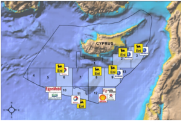
Map showing offshore blocks, including ExxonMobil's, in Cypriot waters of the Eastern Mediterranean

“So long as everyone abides by the rules, there is significant scope for dialogue, not to mention the promise of enormous potential rewards for actual cooperation. Each country that becomes an energy producer – and even non-producers that benefit from lower prices and greater security of supply – will have greater capacity to invest in hospitals, roads, schools, and other powerful contributors to the healthier societies,” Baroudi said. “And each new form of cooperation will bind neighbours that much closer together, pooling their resources and increasing their ability to work together ... Again, as one of the victims of the global economic slowdown, Greece has unquestionable credentials to be among those leading the recovery.”