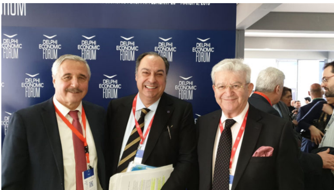
Yannis Maniatis - Member of the Hellenic Parliament; former. Minister of Environment, Energy and Climate Change, Greece