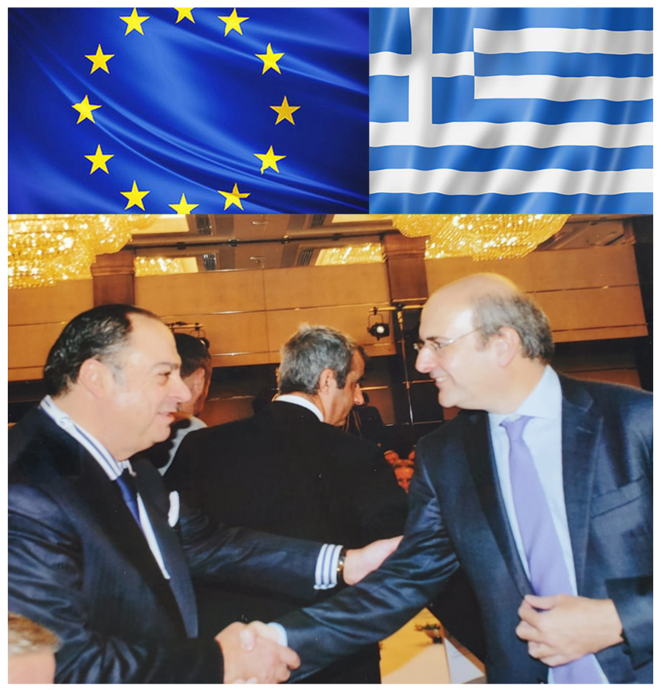
His Excellency Minister Kostis Hatzidakis, Minister of Environment & Energy of Greece, greeting Mr. Roudi Baroudi

With more than four decades in the energy business, Baroudi has helped shape policy and investment choices for companies, governments, investors, and supranational organizations like the United Nations and the European Union. He said the UN and related institutions offered a variety of mechanisms by which