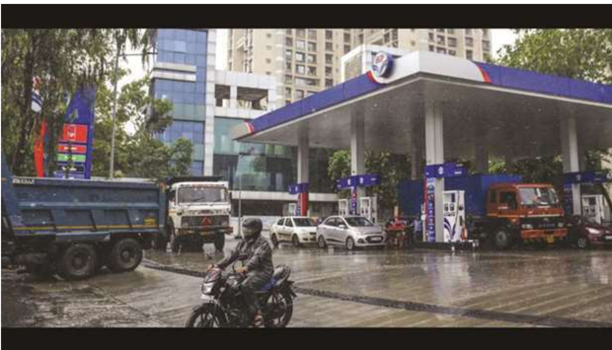
Bloomberg Hong Kong/Singapore