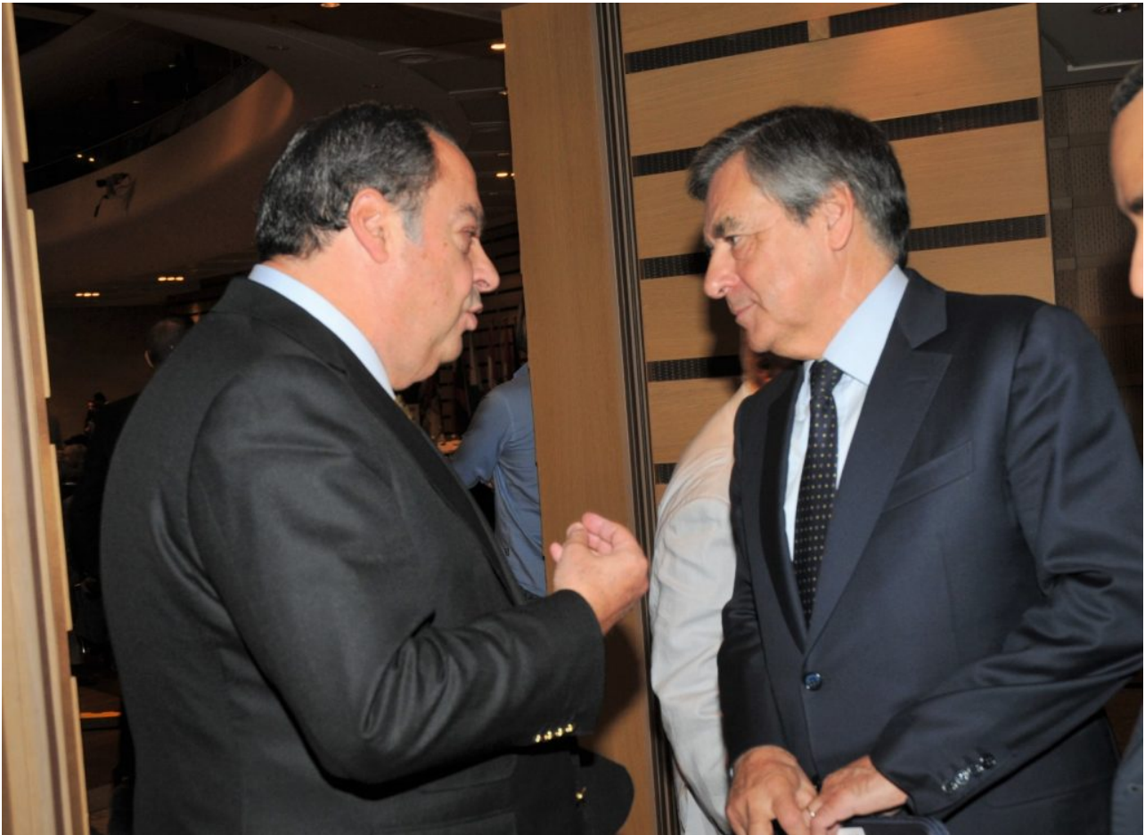
Former Prime Minister of France, Francois Fillon and Energy expert Roudi Baroudi in discussions during the 4th EU-Arab World Summit in Athens, October 2019

Baroudi also mentioned that the EU, for instance, has a clear interest in promoting full Maritime demarcation, not just because it would remove uncertainties affecting its southern members, but also because it would open up new opportunities for the Euro-Mediterranean Partnership by continuing dialogue, reducing frictions and strengthening business ties.