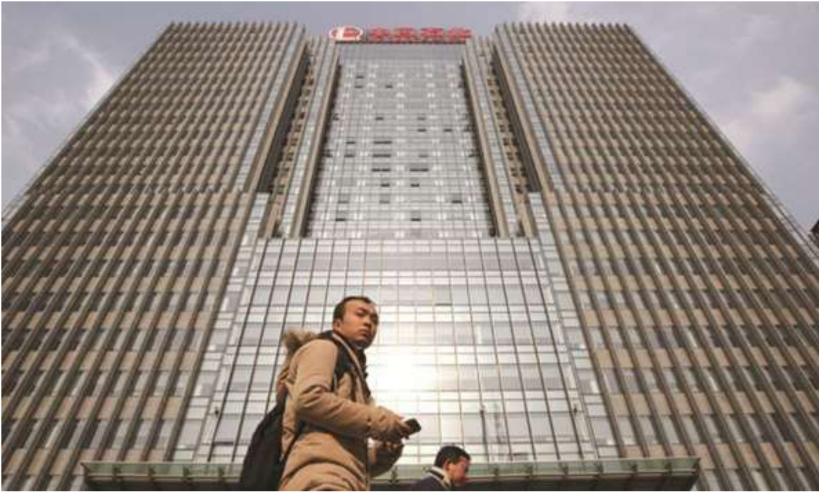
AFP Hong Kong

Most Asian markets rose yesterday, with energy firms surging along with oil prices, as traders await the conclusion of a key Federal Reserve policy meeting.