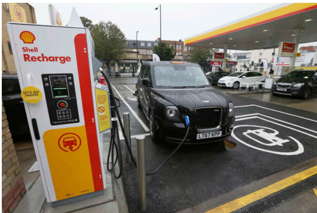
A London taxi plugged into a charging station at a Shell gasoline station in London in 2017, not long after Shell agreed to buy electric-vehicle charging firm NewMotion. Many of the oil industry's biggest companies are investing in