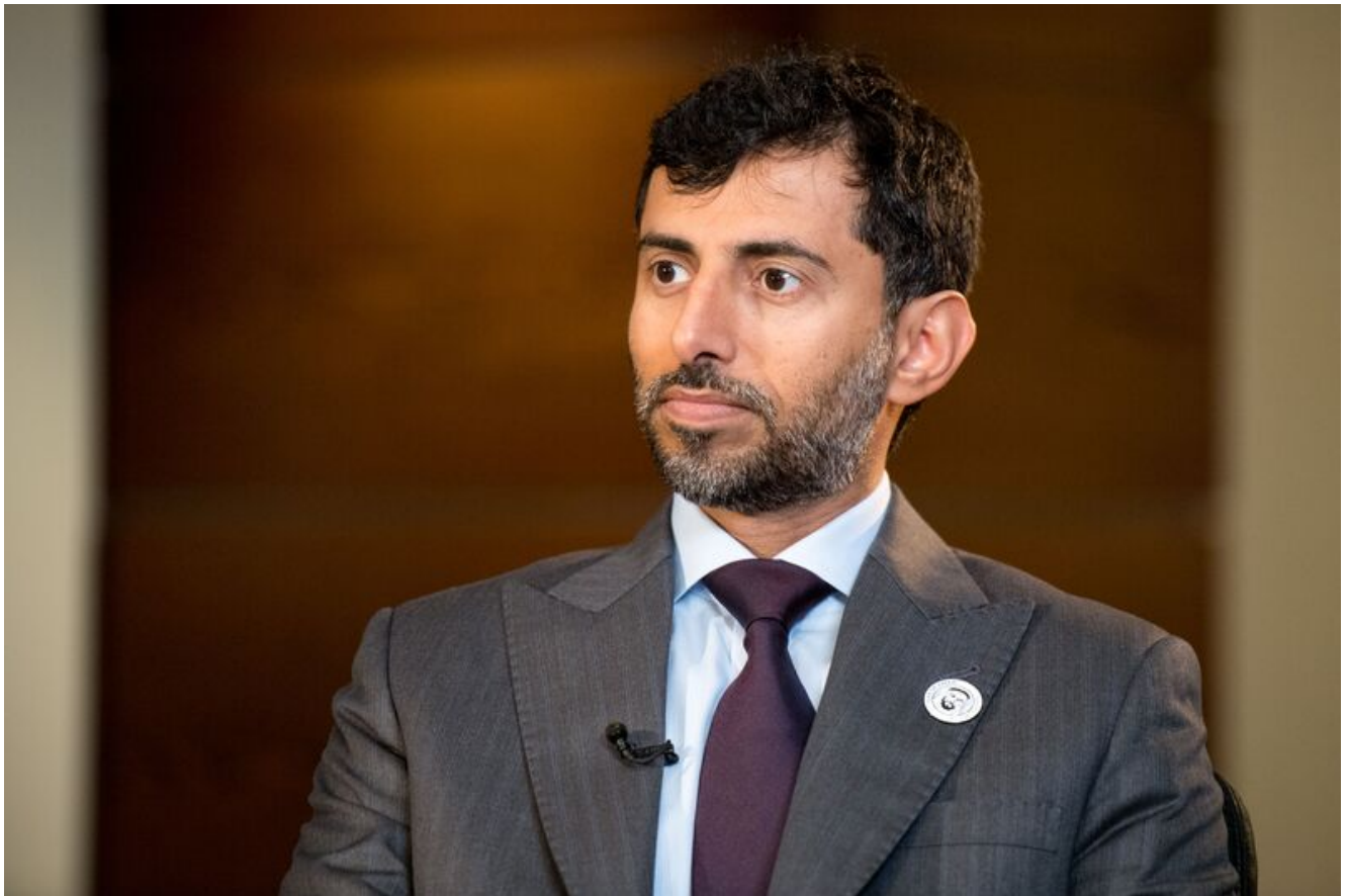
Suhail Al Mazrouei