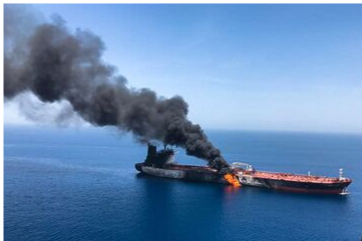
The Front Altair vessel.