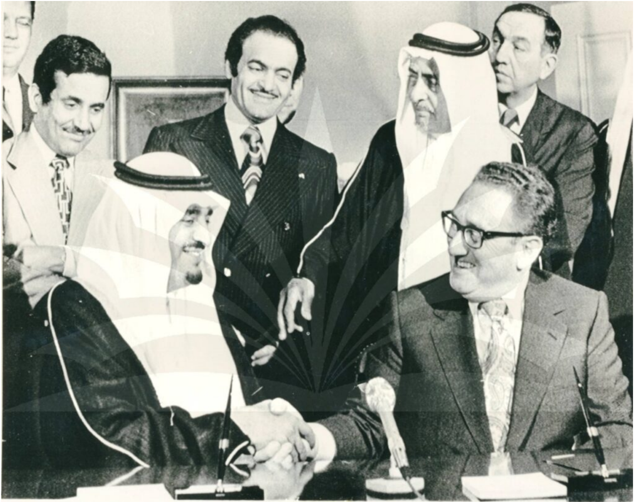
Henry Kissinger with Prince Fahd of Saudi Arabia, 1974

Contrary to widespread misperceptions, the agreement did not say anything about Saudi crude being priced and/or transacted exclusively in US dollars. In a side-deal that remained secret until 2016, however, the United States pledged full military support in virtually all circumstances and the Kingdom of Saudi Arabia committed to investing a massive share of its oil revenues in US Treasury bills. While there was no public quid pro quo, therefore, this was to some extent a distinction without a difference: the world's biggest oil exporter ended up spending hundreds of billions of dollars on American debt and American-made weapons, making it only sensible that the vast majority of its crude sales would be in greenbacks. By extension, the sheer weight of Saudi oil in world markets – and especially within the Organization of Petroleum Exporting Countries – virtually guaranteed that the dollar would become