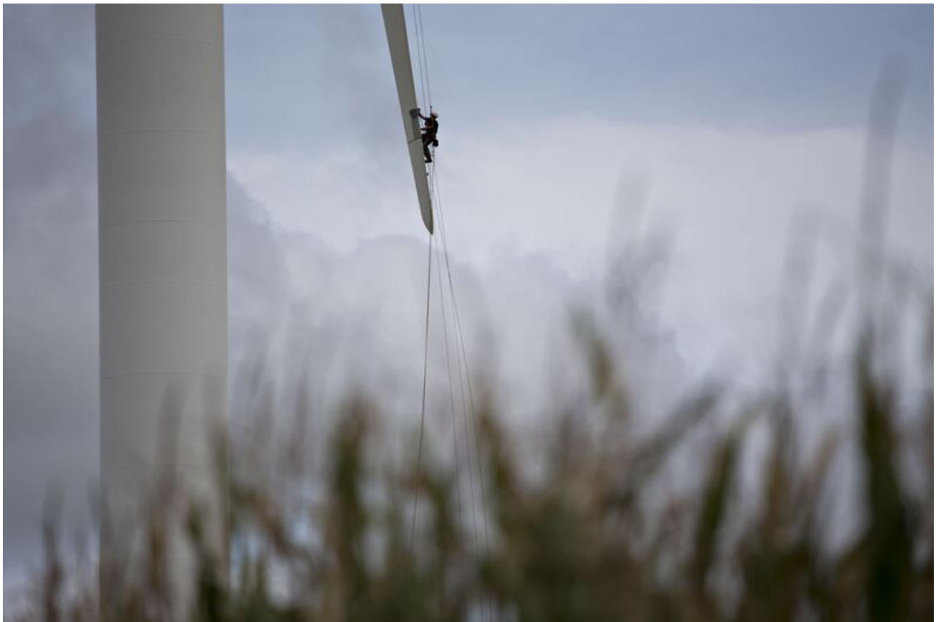
A technician repairs a wind turbine blade in Adair, Iowa.

Fiberglass turbine blades – which in some cases are as long a football field – aren't easy to recycle. And with BloombergNEF expecting up to 2 gigawatts worth of turbines to be refitted this year and next, there could be heaps more headed for dumps.