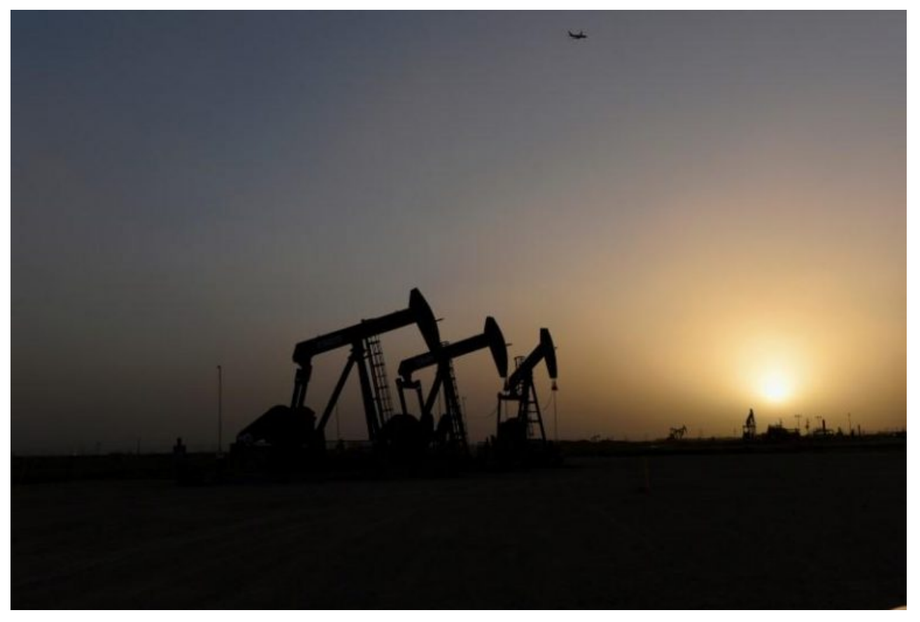
LONDON (Reuters) — Long-term expectations about oil prices remain firmly anchored around $65-70 per barrel, according to