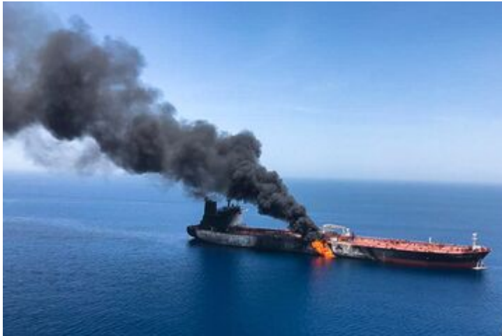
The Front Altair vessel.