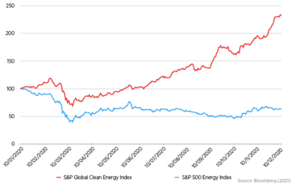
Figure 7: Performance of clean energy and fossil energy stocks in 2020