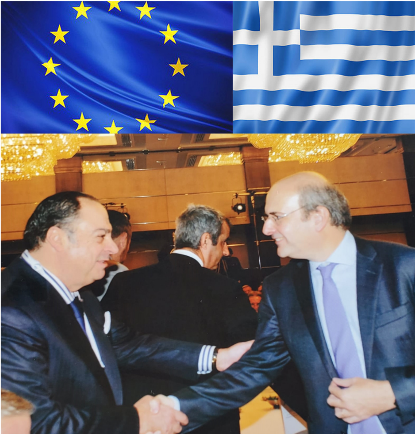
His Excellency Minister Kostis Hatzidakis, Minister of Environment & Energy of Greece, greeting Mr. Roudi Baroudi

With more than four decades in the energy business, Baroudi has helped shape policy and investment choices for companies, governments, investors, and supranational organizations like the United Nations and the European Union. He said the UN and related institutions offered a variety of mechanisms by which