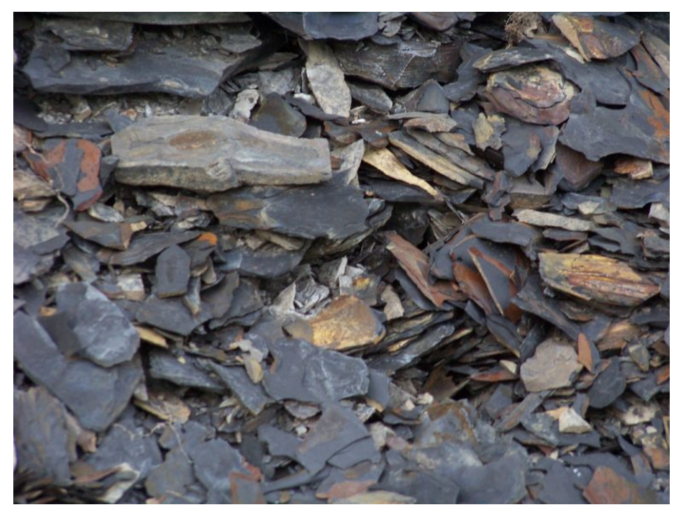
Bloomberg New York

*Dollar plunges by the most since January on Fed's surprise; further losses may hinge on economies outside US perking up The Bloomberg dollar index tumbled 0.5% on Wednesday, making it the worst day since January, after Fed policy makers unexpectedly signalled they'd hold their rates benchmark steady all year because of troubling signs from the economy. Among other problems, that could undermine the currency's appeal by cutting into any yield advantage on dollardenominated assets.