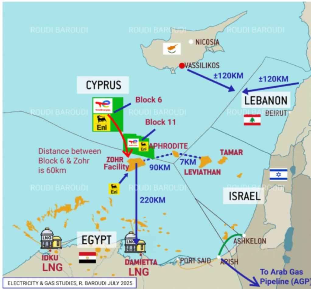
ARTISTIC MAP ILLUSTRATION OF CYPRUS BLOCK 6 GAS & ELECTRICITY PLAY

تبدو العلاقات اللبنانية القبرصية في حال تطور سريع وقد فتح هذا الباب رئيس الجمهورية العماد جوزاف عون فلاقى استجابة ورغبة عارمة لدى نظيره القبرصي كريستو دوليديس تجاه تطوير العلاقة بين البلدين الجارين وما لفت أن الرئيس القبرصي هو الذي بادر وطرح على الرئيس عون استجرار الكهرباء من قبرص إلى لبنان وقد تلقف رئيس الجمهورية اللبنانية هذه المبادرة وطلب من وزير الطاقة جو صدي متابعة