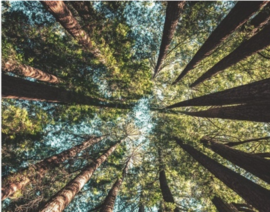
Mara Siana Conservancy, /Kenya/Kuala Lumpur

Across the endless savannah dotted with flat-topped acacia trees, Mara Siana Conservancy in western Kenya teems with elephants, giraffes, zebra and impala, alongside the Maasai people who inhabit the area with their vast herds of livestock.