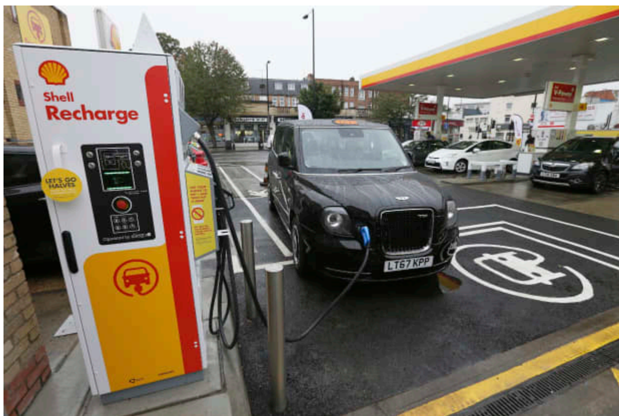
A London taxi plugged into a charging station at a Shell gasoline station in London in 2017, not long after Shell