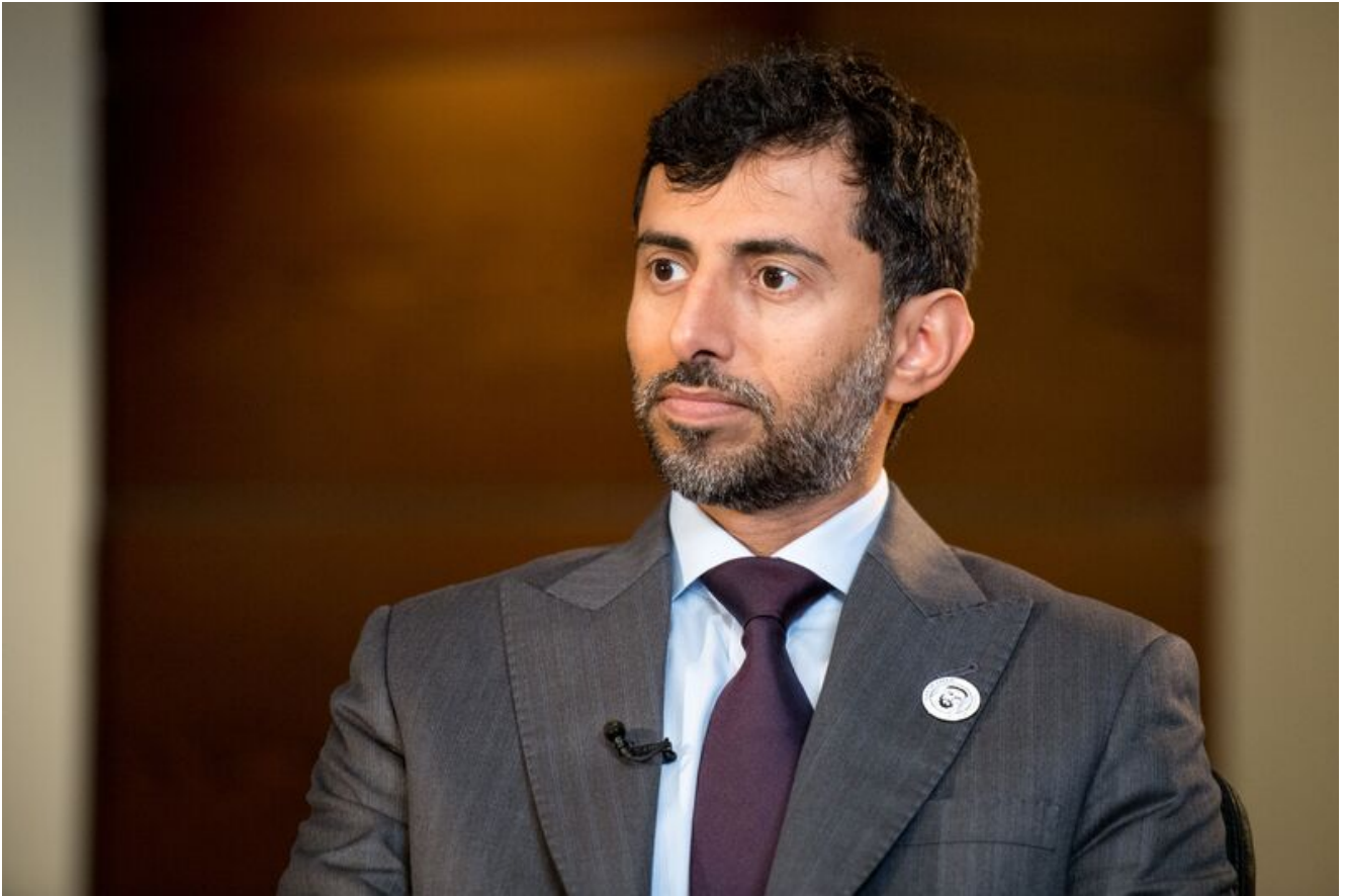
Suhail Al Mazrouei