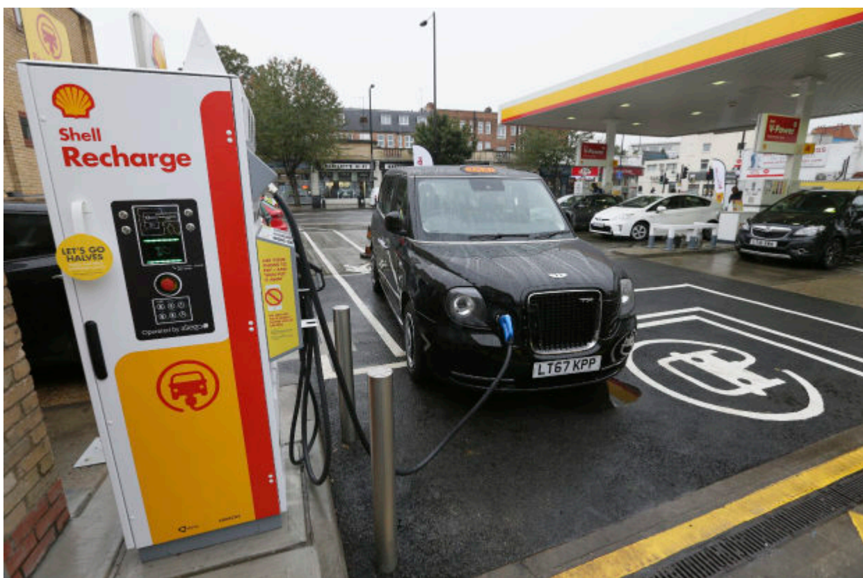
A London taxi plugged into a charging station at a Shell gasoline station in London in 2017, not long after Shell